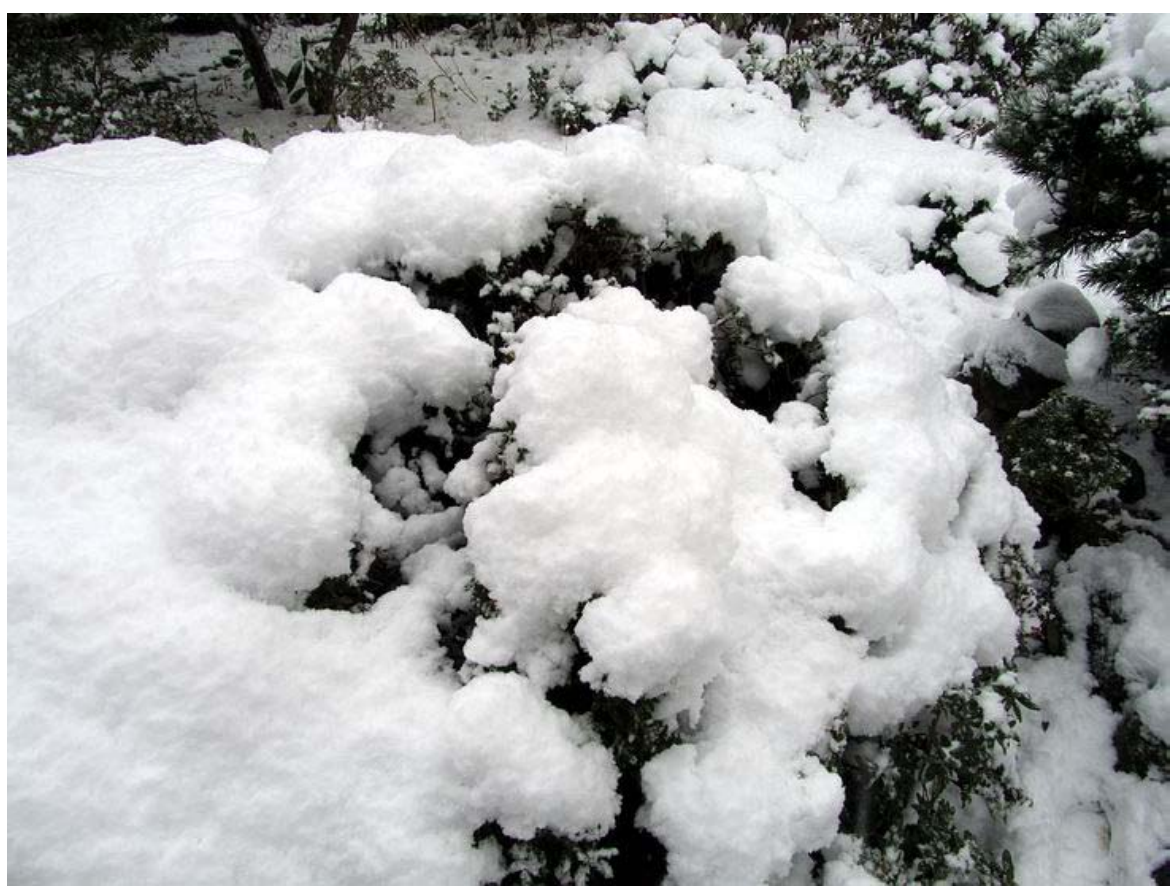
Snow on Rhododendron

Many of the trees and shrubs are decorated by snow like this Rhododendron but there is a point where it ceases to be decorative and can become destructive.