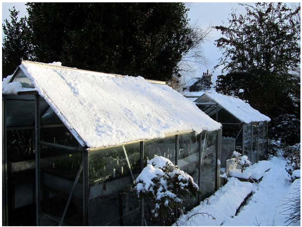
Bulb house with snow removed.

This is one night's snowfall on the bulb house roof and these light weight aluminium structures are not engineered to cope with this significant extra weight so I remove as much as I can each day.