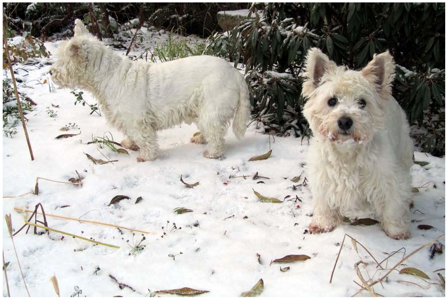
Poppy and Lily

The snow continues to fall but it does not seem to bother Lily and Poppy much except that it is now much deeper than their wee leggies and they do not like ploughing through that so much.