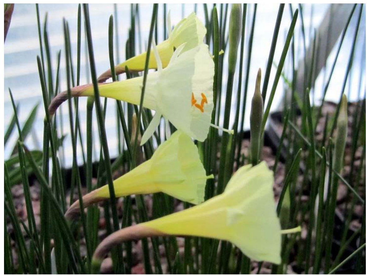
Narcissus romieuxii mesatlanticus

Among bulbs still flowering are this pot of Crocus laevigatus which are just waiting for a bit of warmth to open their flowers – they might have to wait a while.