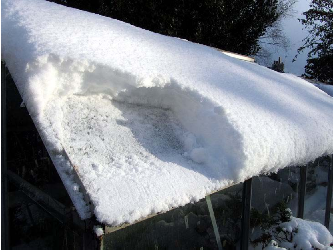
Snow on bulb house roof

This is one night's snowfall on the bulb house roof and these light weight aluminium structures are not engineered to cope with this significant extra weight so I remove as much as I can each day.