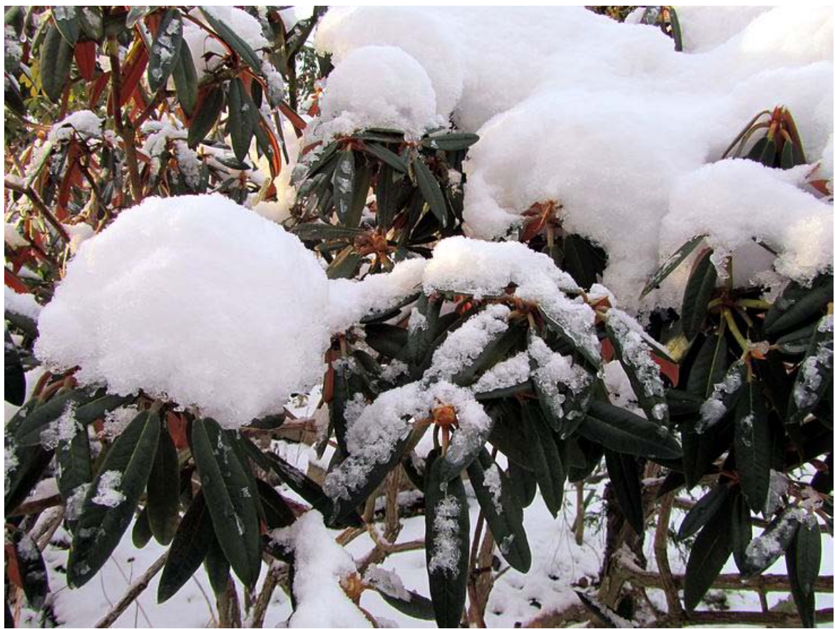
Snow on Rhododendron

Many of the trees and shrubs are decorated by snow like this Rhododendron but there is a point where it ceases to be decorative and can become destructive.